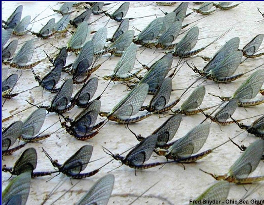
Fred Snyder - Ohio Sea Grant