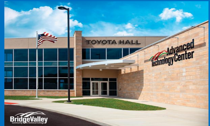
Southern WV Advanced Technology Center South Charleston, WV

Designed to prepare students for employment in the upstream, midstream and downstream segments of the oil and gas industry